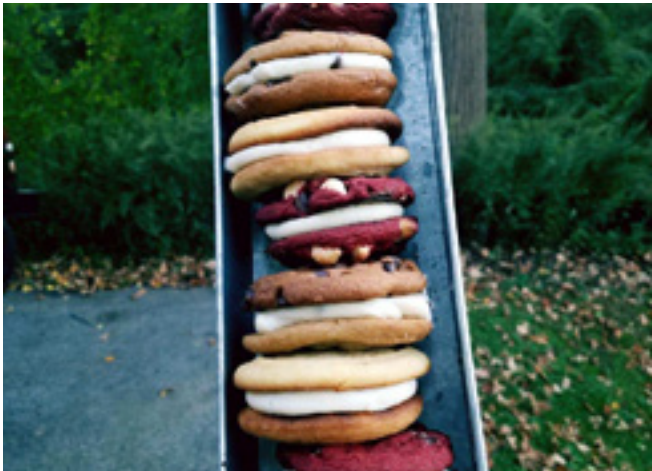
CANNOLI CREAM SANDWICHES