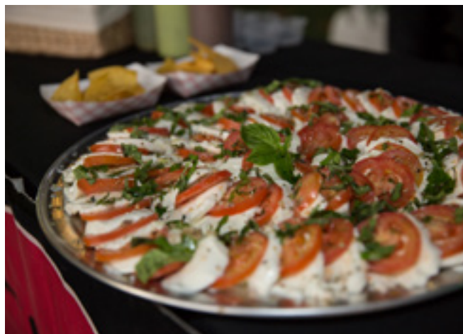
TOMATO / MOZZERELLA PLATTER