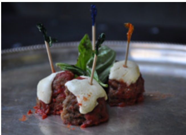
MEATBALLS / MARINARA