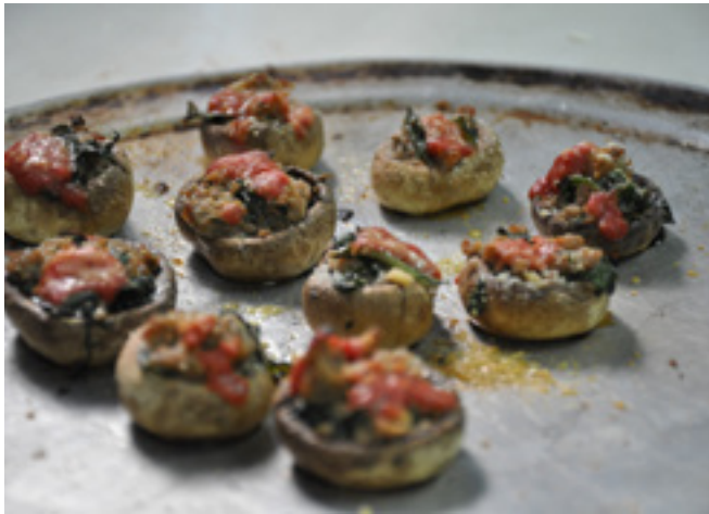
MEATBALL STUFFED MUSHROOMS